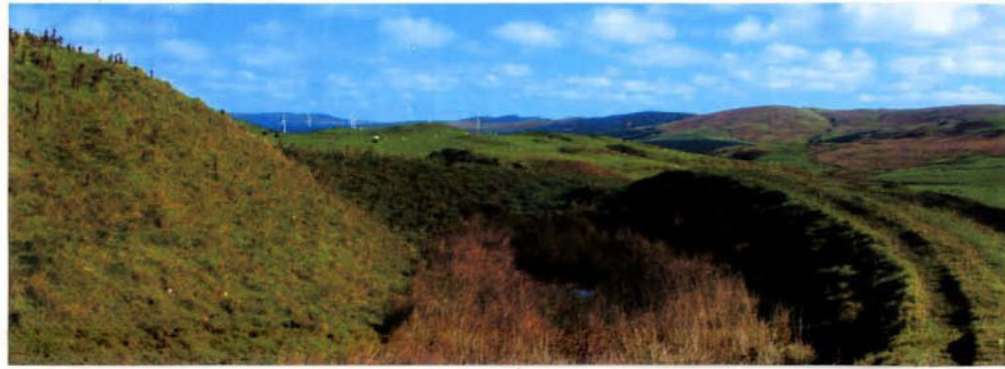
VIEW LOOKING EAST SHOWING THE INNER DITCH TODAY