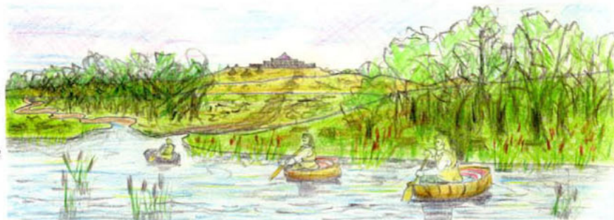
AN IMPRESSION OF DUN BHEINN SEEN FROM AN ANCIENT LOCHAN NEAR DALDOWIE, (DAIL DUARONE - THE VALE OF THE BATTLE).

DINVIN ( FIRST SPELT IN 1828 ) IS A CORRUPTION OF DUN BHEINN, ( ANCIENT BRITHONIC ) MEANING HILL ( OR MOUNTAIN ) FORTRESS. IT IS LIKELY THAT THE FORTRESS WATCHED OVER A HUGE " BAILEY " ON THE PLATEAU WHERE YOU ARE STANDING, AS FAR WEST AS THE RUINS OF FARDENDREW, JUST VISIBLE AMONGST THE TREES AND A HALF MILE FROM THE MOTTE.