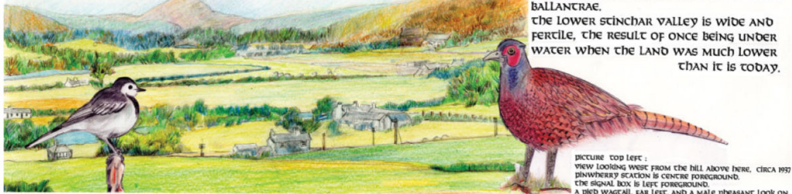
PICTURE TOP LEFT : VIEW LOOKING WEST FROM THE HILL ABOVE HERE, CIRCA 1937 PINWHERRY STATION IS CENTRE FOREGROUND, THE SIGNAL BOX IS LEFT FOREGROUND, A DIED WAGTAIL, FAR LEFT, AND A MALE PHEASANT LOOK ON.

THE ARRIVAL OF THE GLASGOW AND SOUTH WESTERN RAILWAY, IN 1877, BROUGHT ECONOMIC OPPORTUNITIES TO SMALL, RURAL COMMUNITIES, LIKE PINWHERRY AND PINMORE, STIMULATING CHANGE AS NEVER BEFORE.