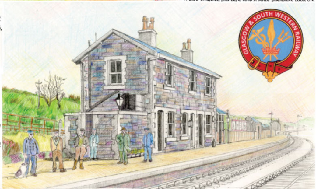
ABOVE: PINWHERRY STATION, AUTUMN, 1921