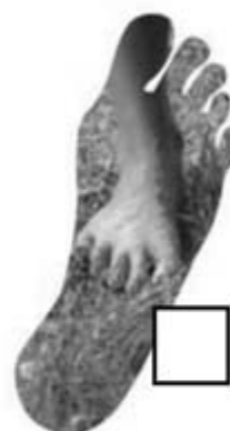
splashes of rain