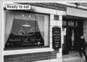
Ready to eat