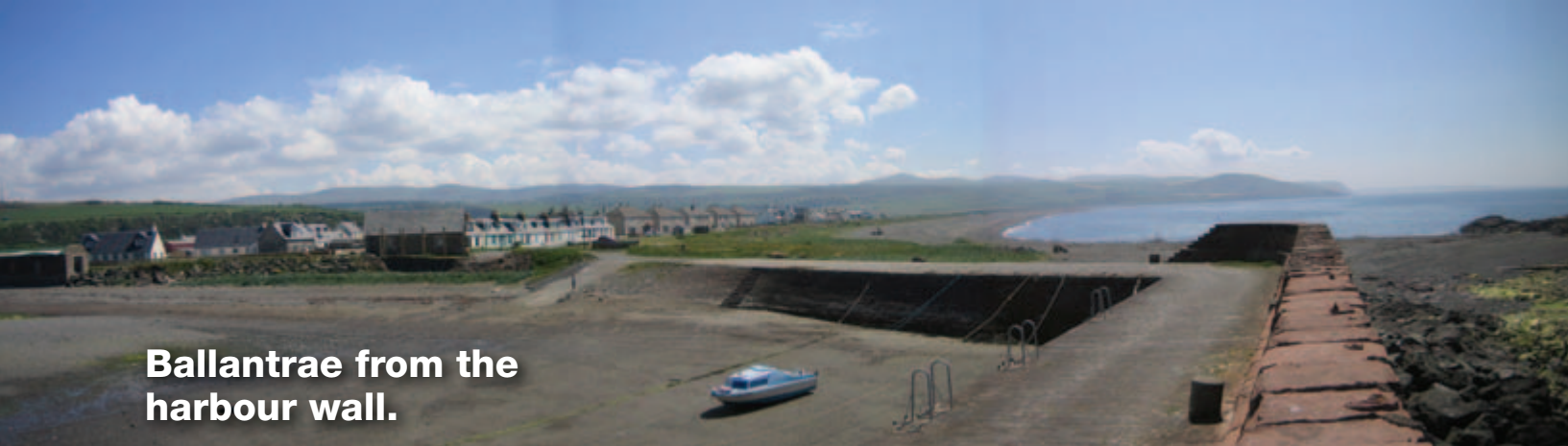
Ballantrae from the harbour wall.