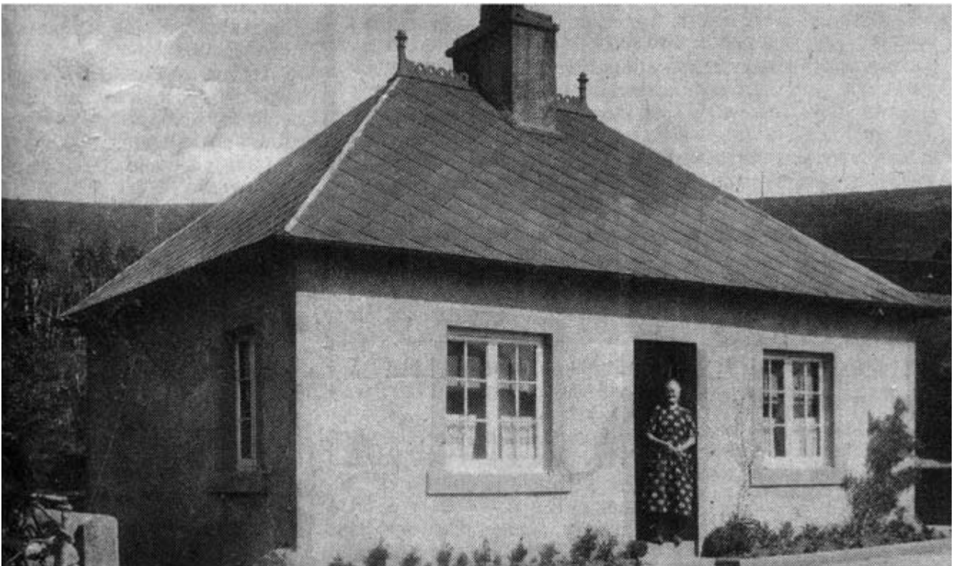
This cottage is no longer in existence. It was positioned on the A714, as you go through Pinwherry from Girvan and just on the sharp corner before you cross the bridge was where this cottage sat.

This is part of an article and photographs appeared in the Carrick Gazette, Friday, 3rd June, 1988