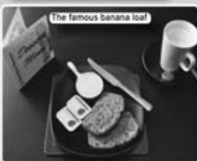
The famous banana loaf

For all reservations PLEASE CALL 01465 714069