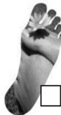
the warm sun