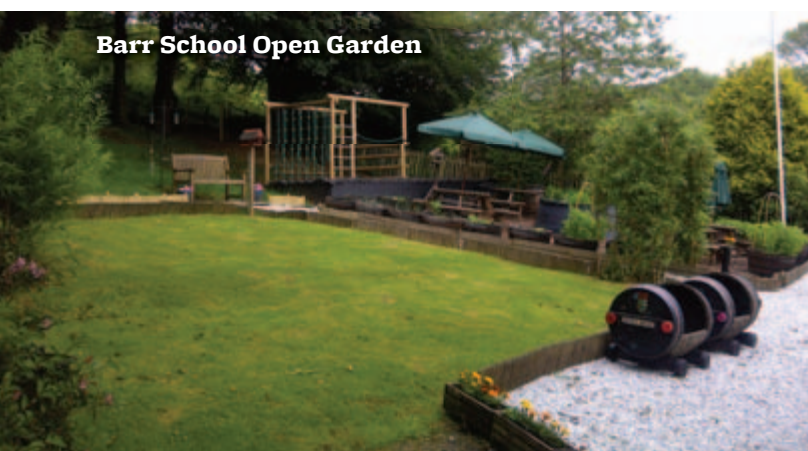
Barr School Open Garden