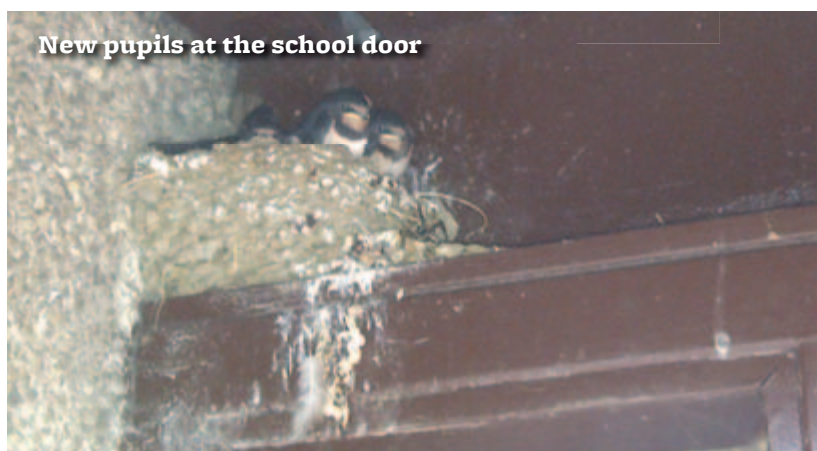
New pupils at the school door