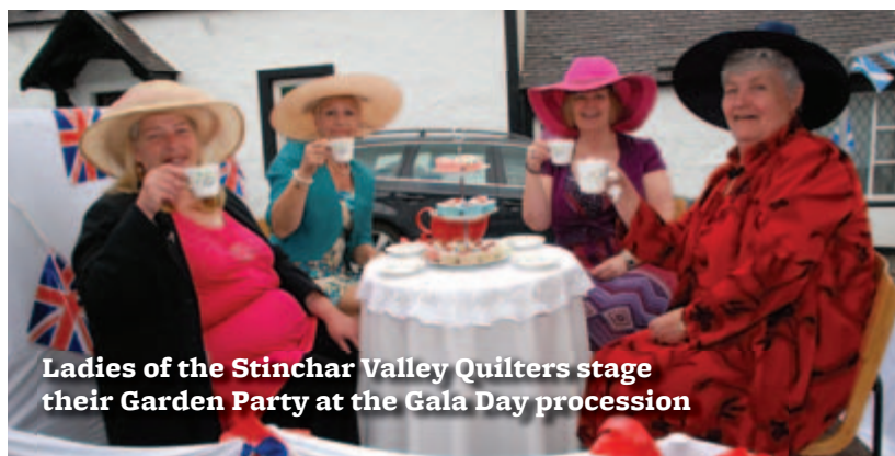
Ladies of the Stinchar Valley Quilters stage their Garden Party at the Gala Day procession