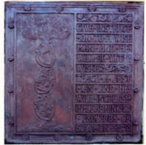
ABOVE THE BRONZE PANELS SNELL MEMORIAL